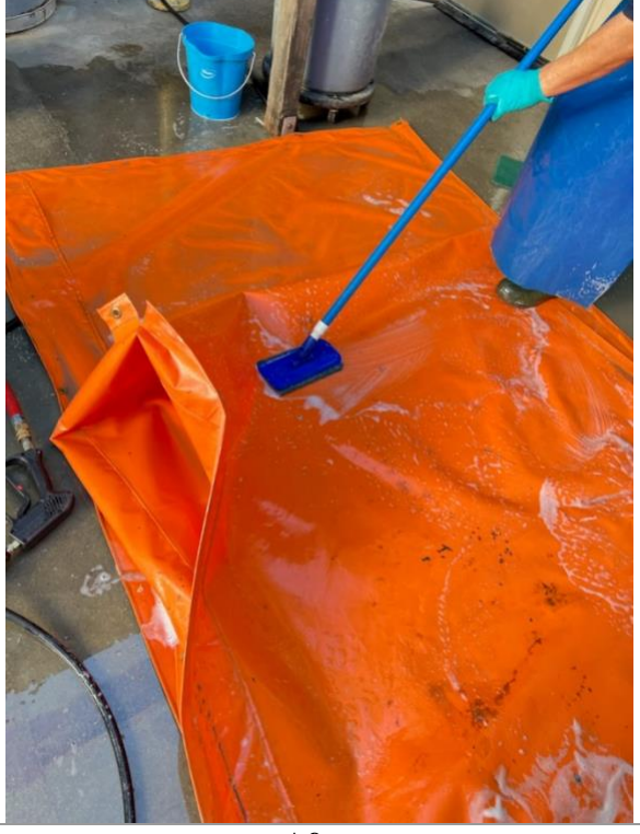
After Typical results for all tarps