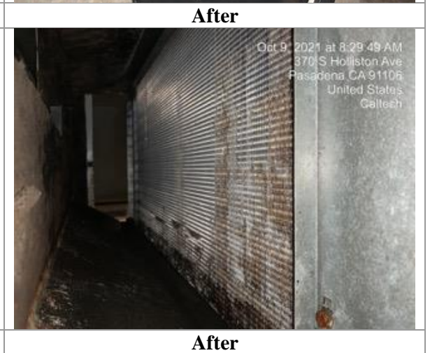
TREBLA Industrial Resources, Inc. | 600 S. Orange Ave, Fullerton, CA 92833 | www.TreblaInc.com