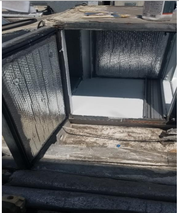
After Supply filter area with silver bullet, wall panel and access with Astro Shield