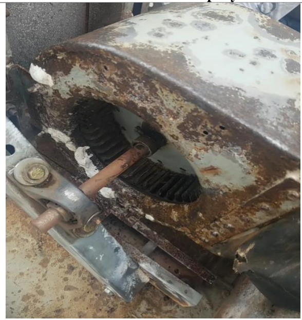
In progress Metal treated with converter; metal cracks welded with underwater epoxy seal