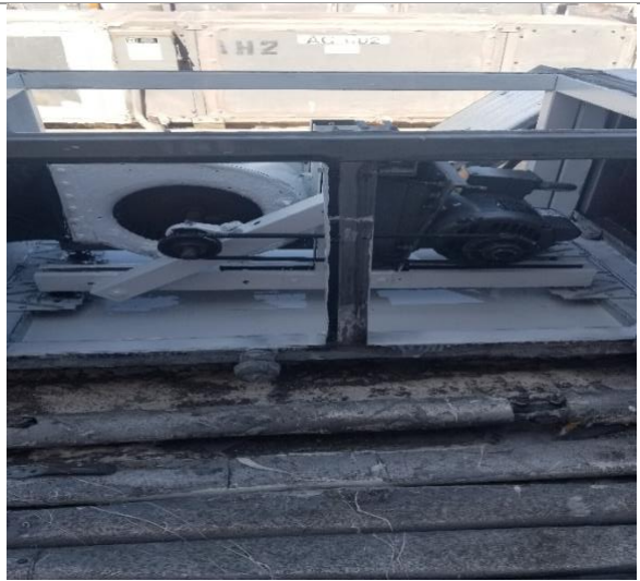
After Fan painted with second layer of Silver Bullet and after sheet metal repair.