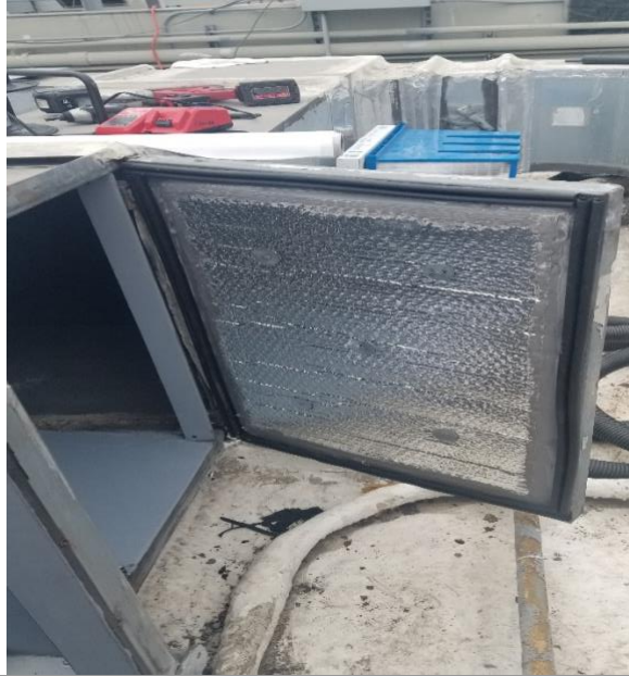
After Astro Shield added to access doors. DP1010/DP1030 added to seams to ensure complete encapsulation. New gaskets added to access doors to improve loss of CFM within unit (primer before adding paint to interior)