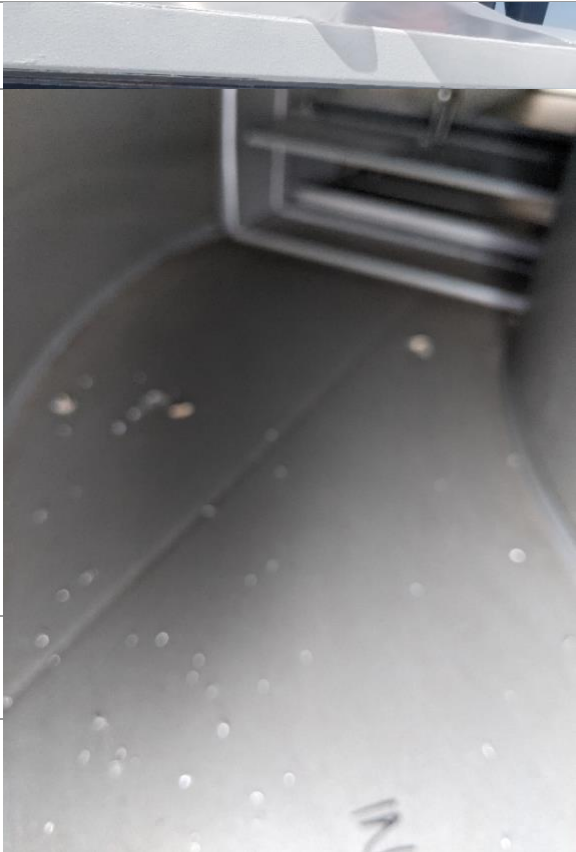
Before Small duct run with some debris