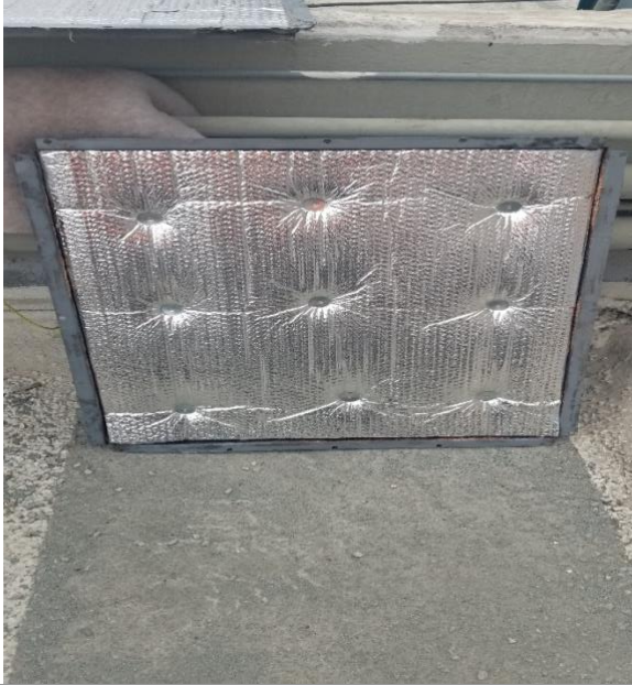
After All Astro Shield pinned