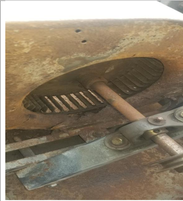
In Progress Fan wired brushed