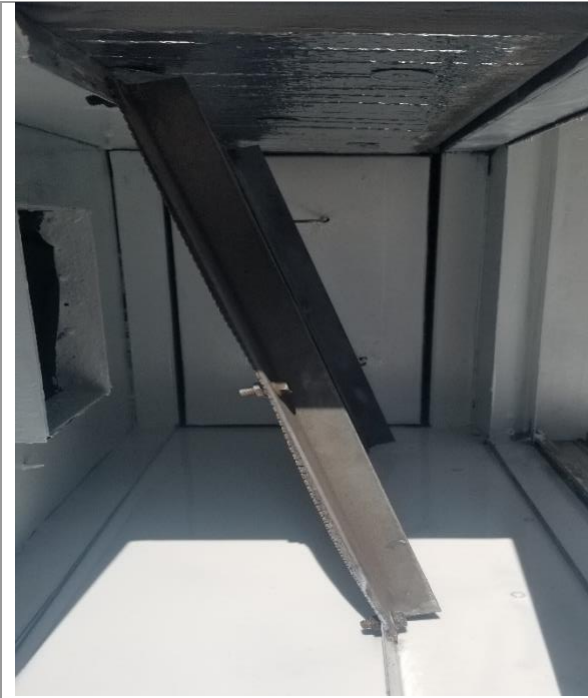
After Supply area with Silver Bullet and PC 260 (Astro Shield on roof of unit)