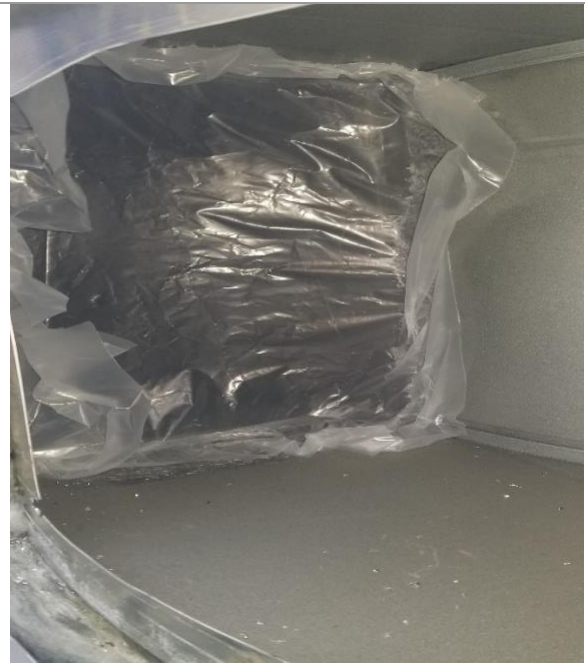
Vertical duct (interior) sealed prior to start of project - Infectious Control