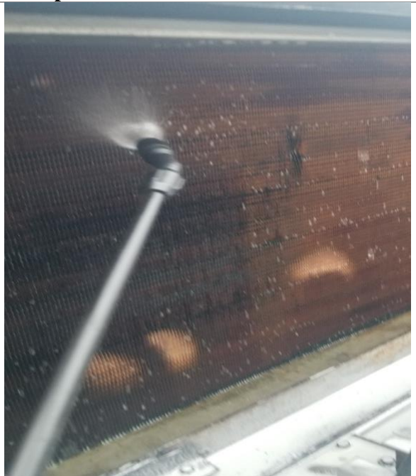
After Evap used to clean sensitive equipment