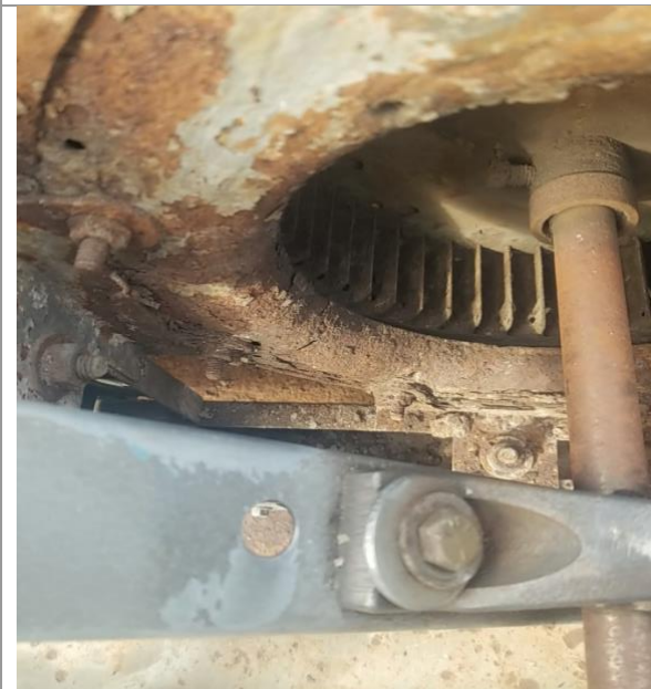
Before Fan area with significant corrosion, rust and deterioration