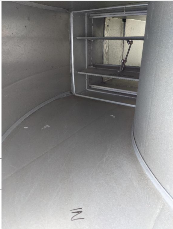
After Debris cleaned. White specks are stains of some sort, possibly mastic