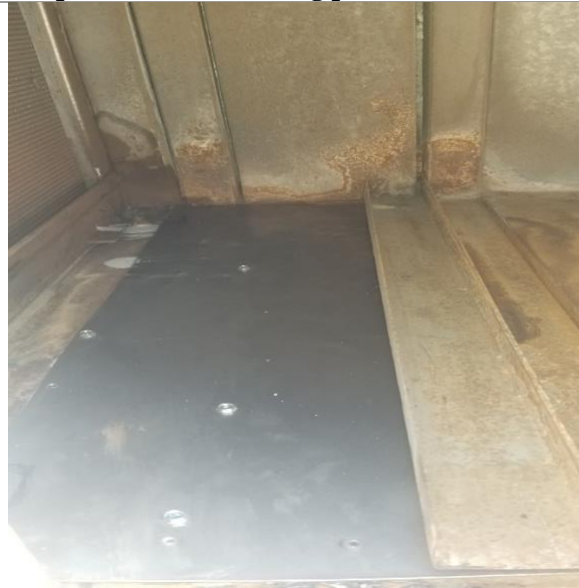
In Progress Area wired brushed and new sheet metal