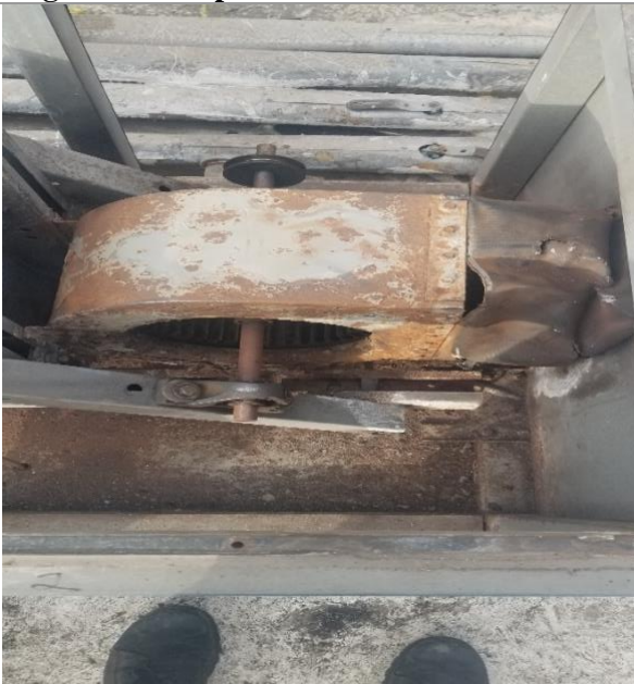
Before Fan area with significant corrosion, rust and deterioration (Flex connector compromised)