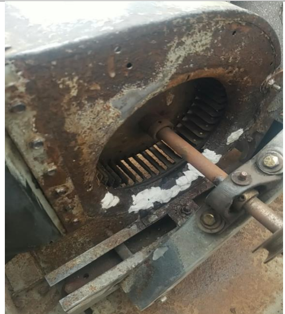
In Progress Metal treated with converter; metal cracks welded with underwater epoxy seal