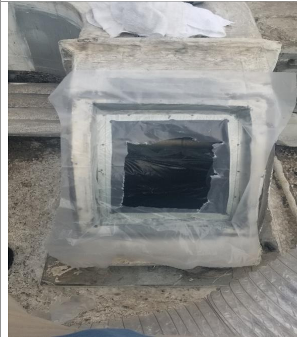
Access created on vertical duct and sealed prior to start of project