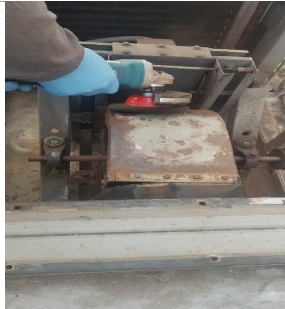
In Progress Wire fabric brush (Prep for repair and epoxy)