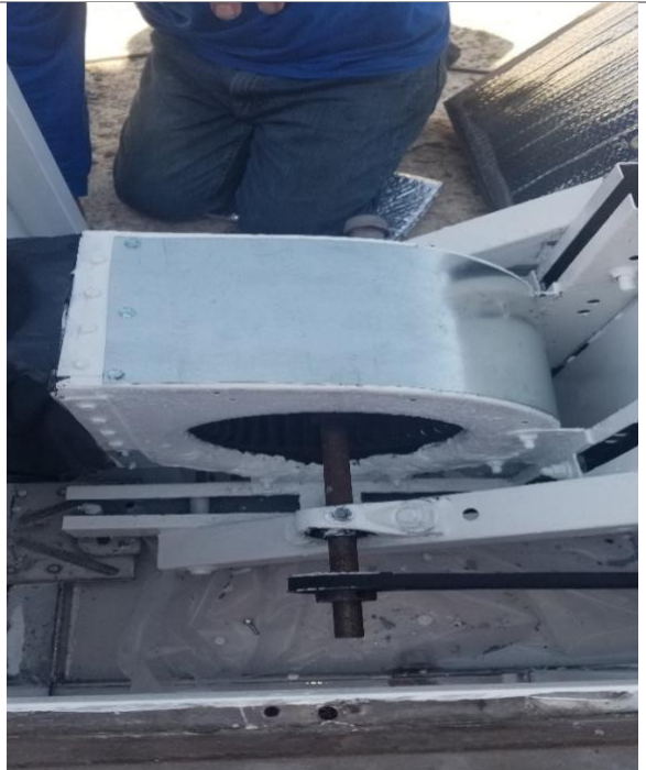
In Progress Fan painted with Silver Bullet Epoxy after repairs. Additionally, team overlapped/wrapped sheet metal from top to bottom to seal breach (hole) at the bottom of fan