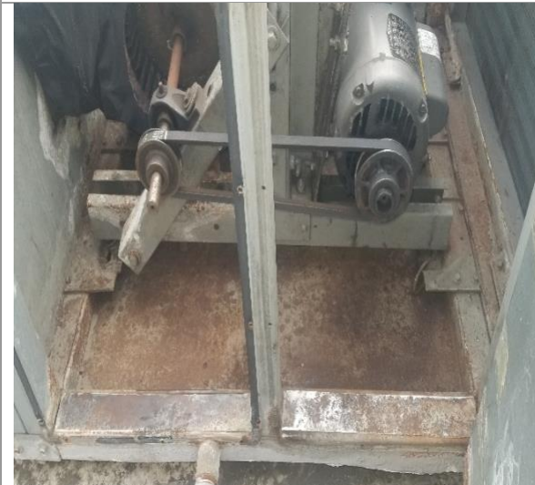
Before Fan area with extreme corrosion