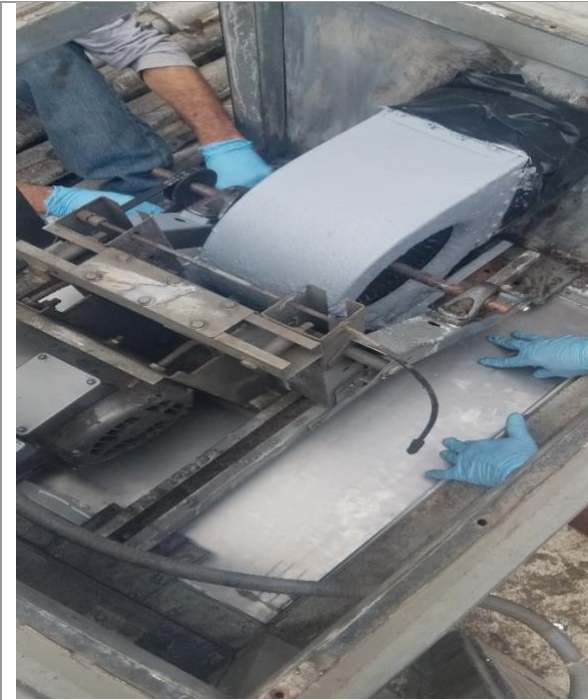
In Progress Silver Bullet Primer used before painting, New sheet metal introduced to base of duct