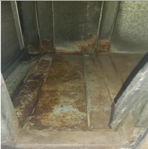
Before Outside air filter area